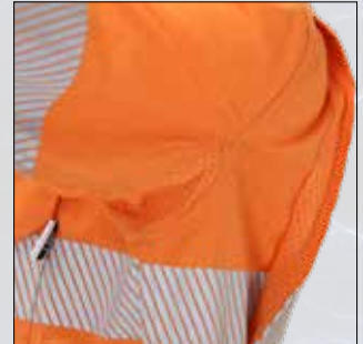
BACK AND UNDERARM VENTING