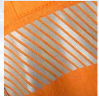
HEAT APPLIED FR TAPE, REDUCING THE WEIGHT AND INCREASING THE COMFORT & FLEXIBILITY OF THE GARMENT