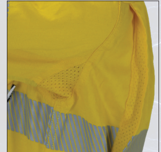
BACK AND UNDERARM VENTING